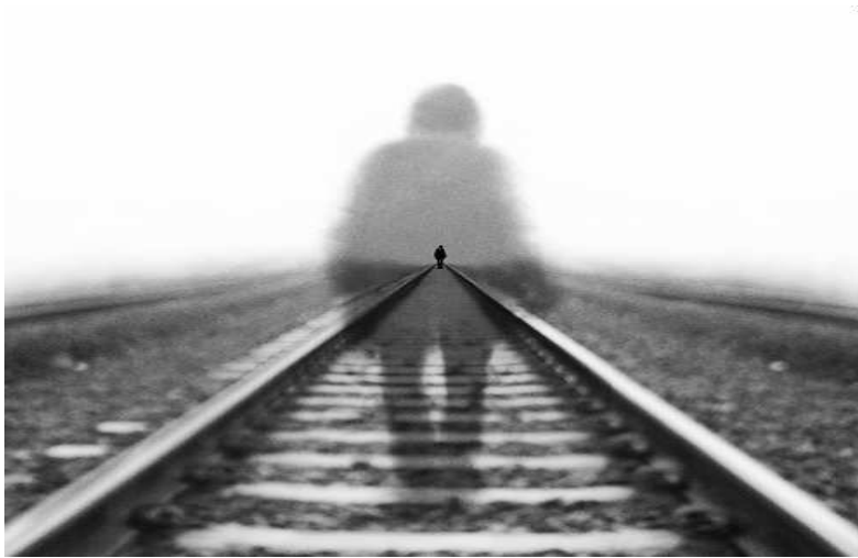
Responsibility Claim for sabotage of the tramlines